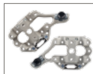
Brackets for the wheelchair